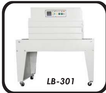
Shrink Wrapping Tunnel