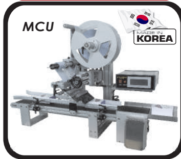
Top Surface Auto Labeler