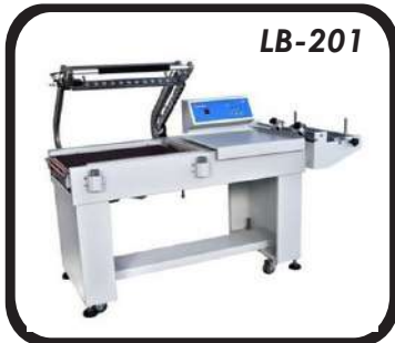
Automatic Sealing Machine