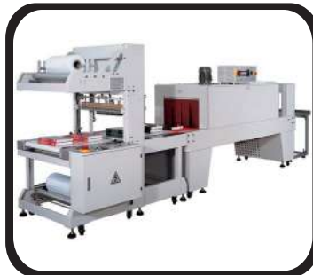
LB-5038B (Pneumatic) LB-5040A (Tunnel)