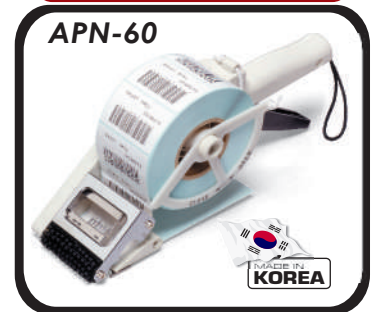
LUNWA Labile Applicable