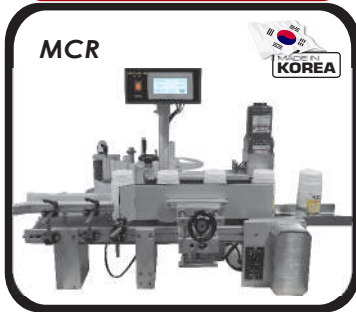
Auto Bottle Labeler